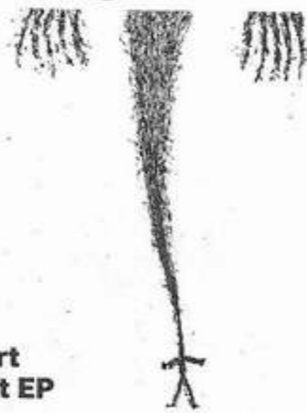
Artwork for Bleeding Heart Pigeons debut EP