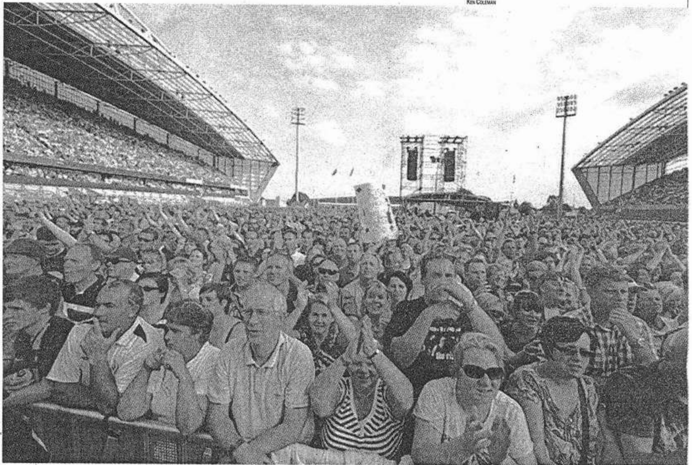
Some of the 30,000 fans who packed into Thomond Park for last night's Bruce Springsteen concert