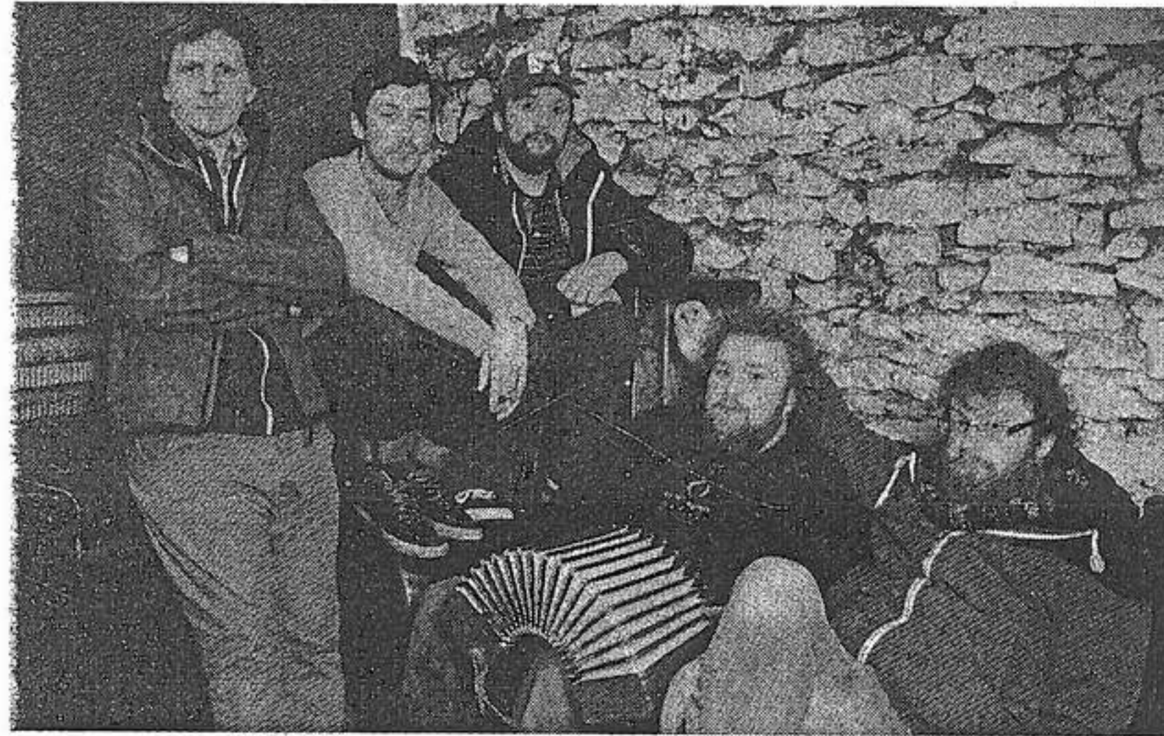
Windings will play at the Choice Music Prize show at Vicar St. Dublin this Thursday

There is no slowing down this weekend, Sunday March 10, Tokyo Goats are back providing a savage mix of Rock, Reggae, Pop and Funk. Relax and unwind or rock your socks off in the bar to some great sounds from the guys. Then don't forget Icon nightclub for Super Sunday. Lots to plan for in Smyths this weekend.