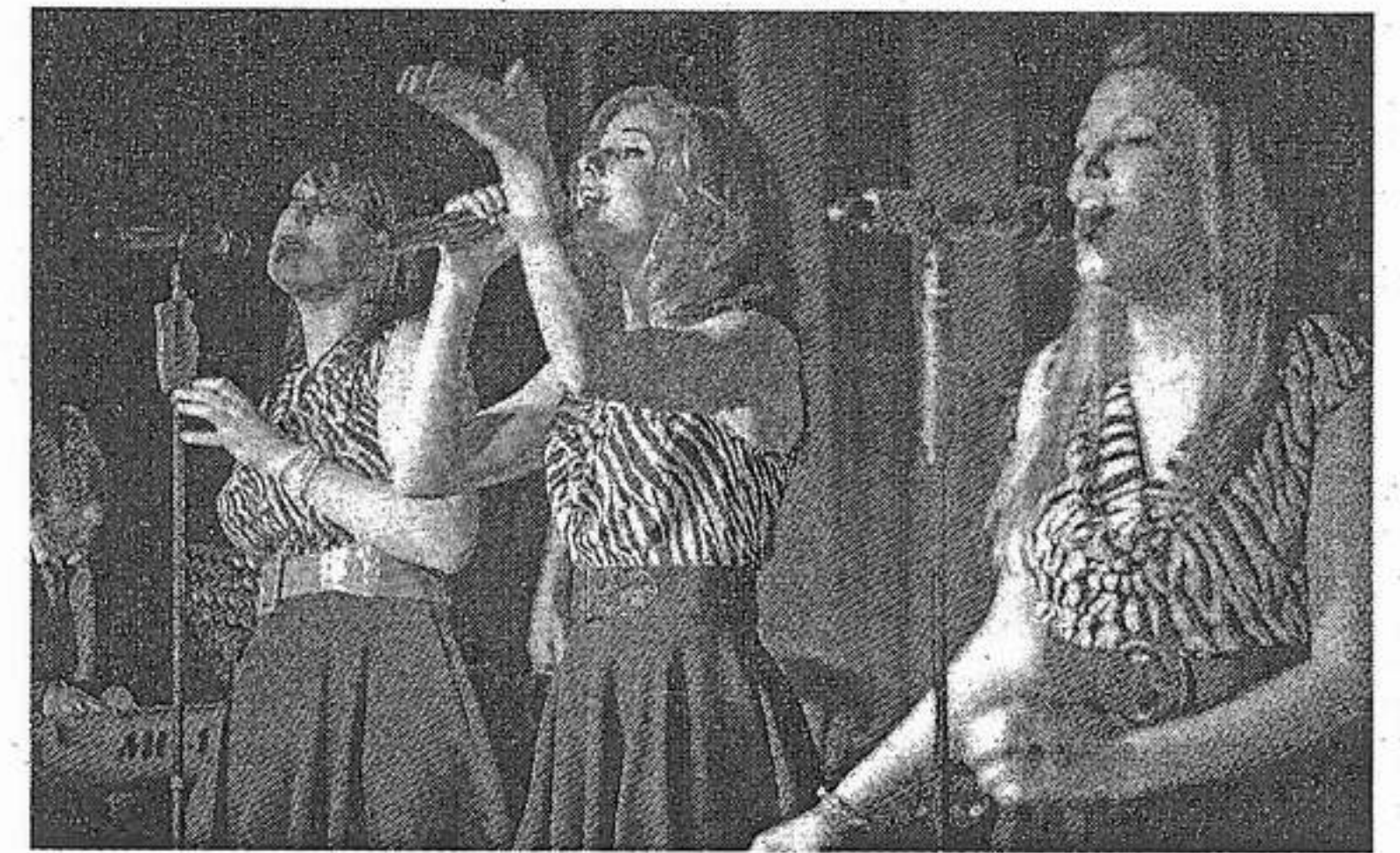
The Papa Zitas play Smyths this Saturday.

DeLorean Suite will perform with a full band this Saturday March 9 in Dolan's. Guests include dREA and local DJs.