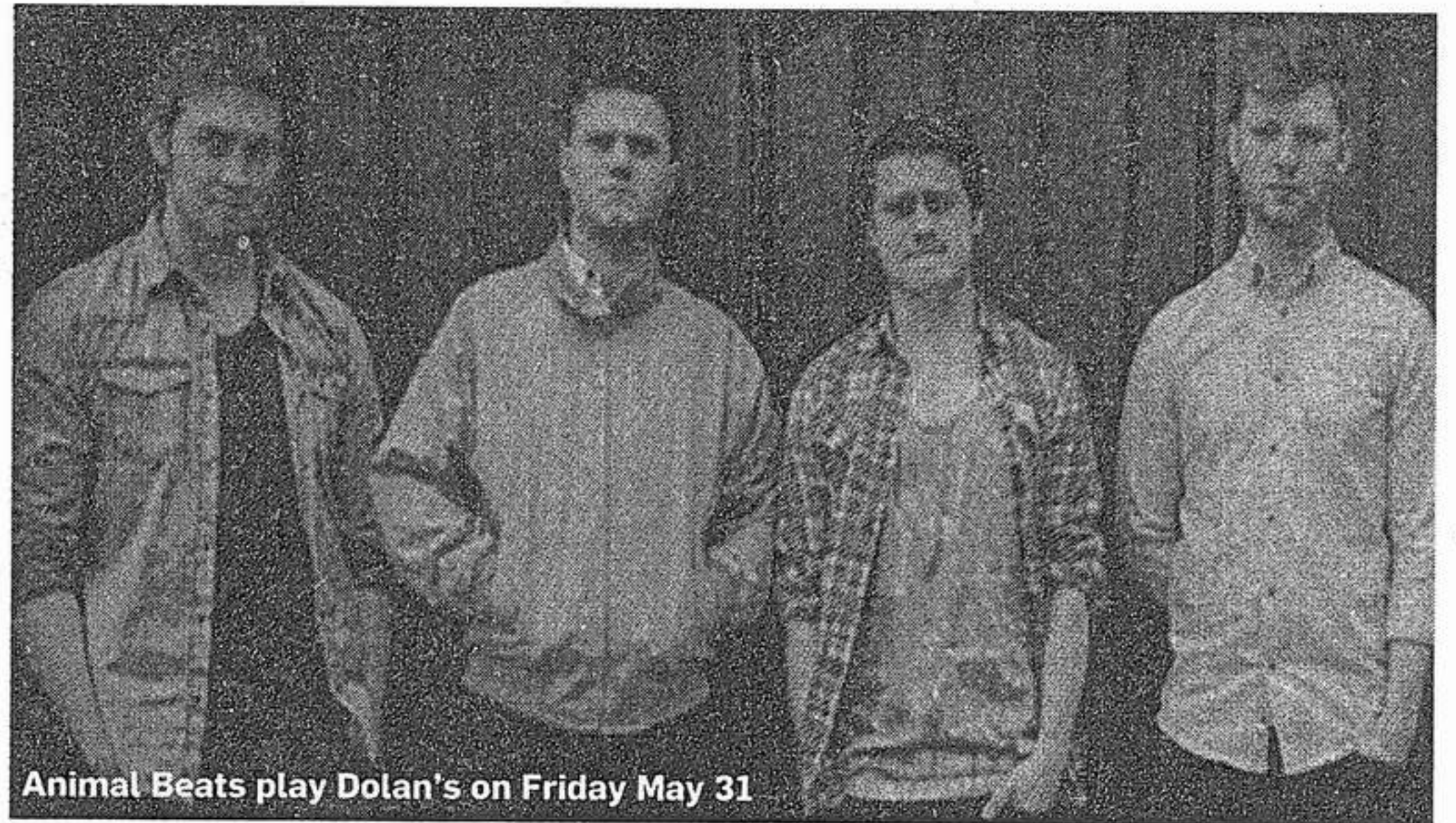
Animal Beats play Dolan's on Friday May 31