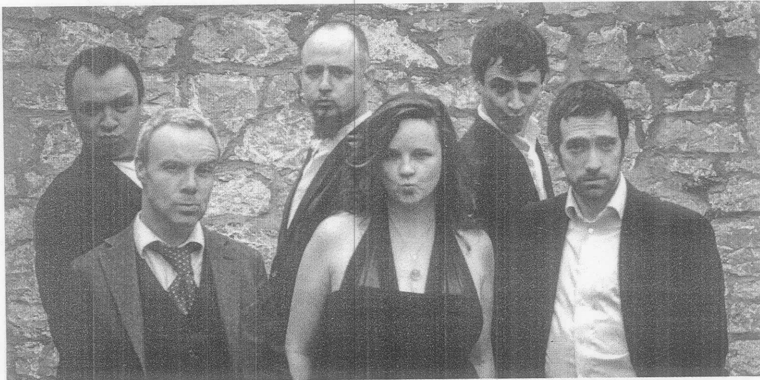
The Brad Pitt Light Orchestra in full 'Blue Steel' effect will release new material in the new year. The band play Dolan's on Sunday December 23