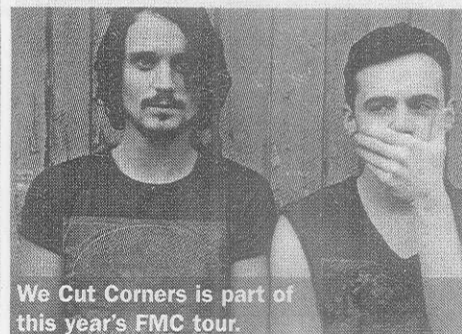
We Cut Corners is part of this year's FMC tour.

AS First Music Contact (FMC) is doing the annual tour, this year's featuring We Cut Corners, Squarehead, The Lost Brothers and a local act to be announced. The tour rolls into Dolan's on November 3. With funding from The Arts Council's Touring and Dissemination of Work Scheme, the previous tours in 2010 and 2011 were a massive success. FMC works with artists both at home and on the international stage through various projects and this FMC tour is an opportunity to showcase some standout Irish talent.