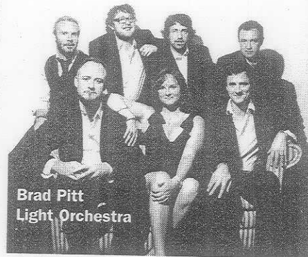
Brad Pitt Light Orchestra

This weekend two of the bands (BPLO and Hermitage Green) get to practice for this show at Electric Picnic in Stradbally.