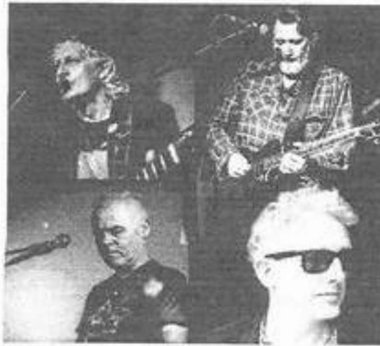
The Record Room this Friday March 6.

As well as familiar songs from the albums and live set, expect to hear lots of new songs currently being rehearsed and demo'd for the next album.