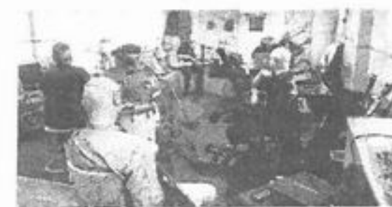
THE FIRST EVER REHEARSAL

There is plenty to inspire on the album 'Can You Hear Me' as this band with mileage on the tour-van clock have brought together a set of songs reflecting on any wisdom