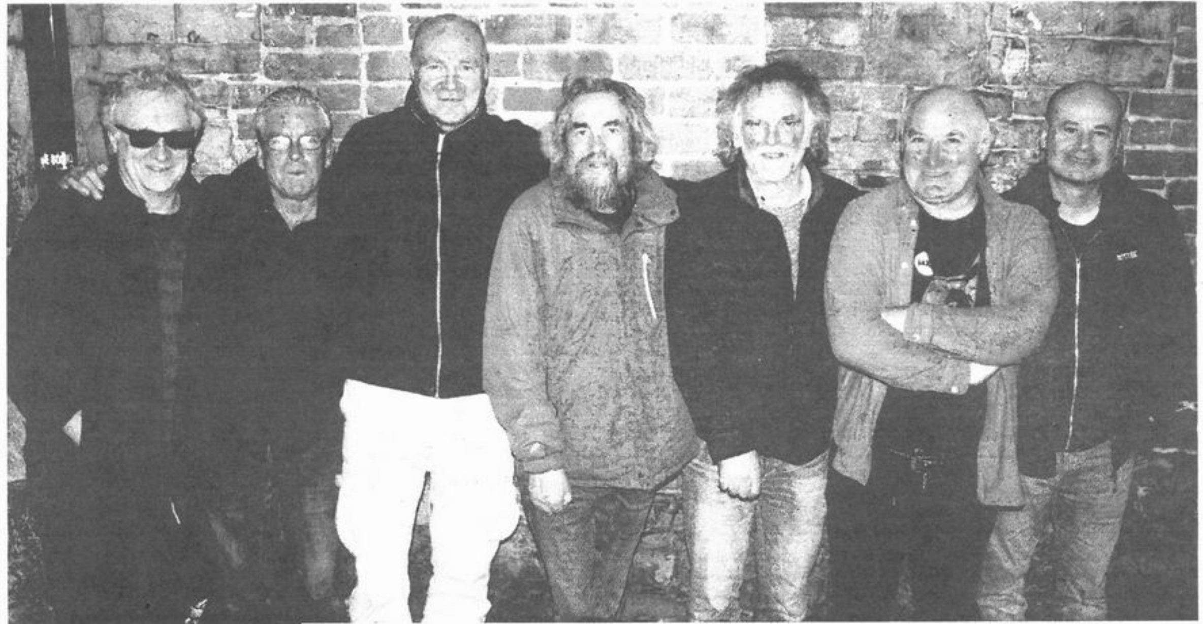
The O'Malleys launch new album 'Can You Hear Me' at Lime Tree Theatre this Thursday June 6