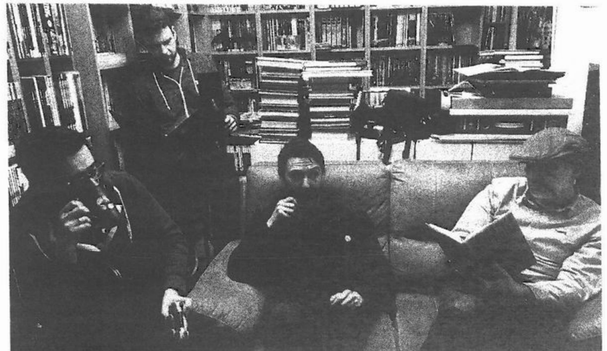
Zombie Picnic play Kasbah Social Club Dolan's this Friday March 9

"Tracks are born out of jam sessions with a bit that someone has come in with. We'll take that bit and it will start to grow and grow until it becomes a section rather than a bit.