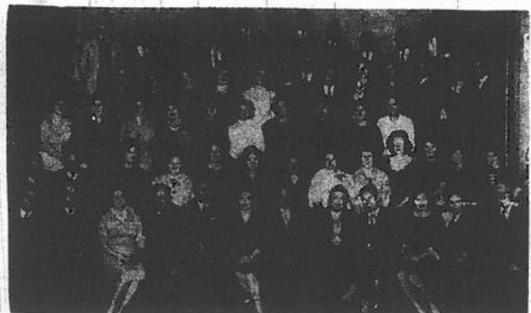
LIMERICK CHORAL AND OPERATIC SOCIETY