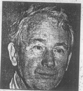
Frank McCourt: much to say about Limerick

Now surely this is a great opportunity for May-