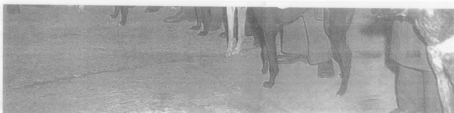
Dapper parade: local men get ready to bring the finalists out for the Irish St Leger, the classic competition synonymous with the Markets Field