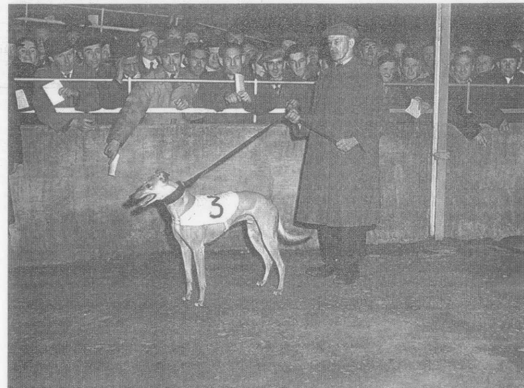
The packed crowd at the Markets Field in 1955 pay tribute to a sweep winner and his owner