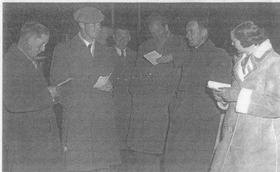
Racegoers at the Markets Field in 1955 discussing the form before the races