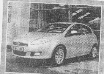
2009 Fiat Bravo 1.6 TURBO DIESEL Dynamic DEMO 5 door PRICE: €20,700