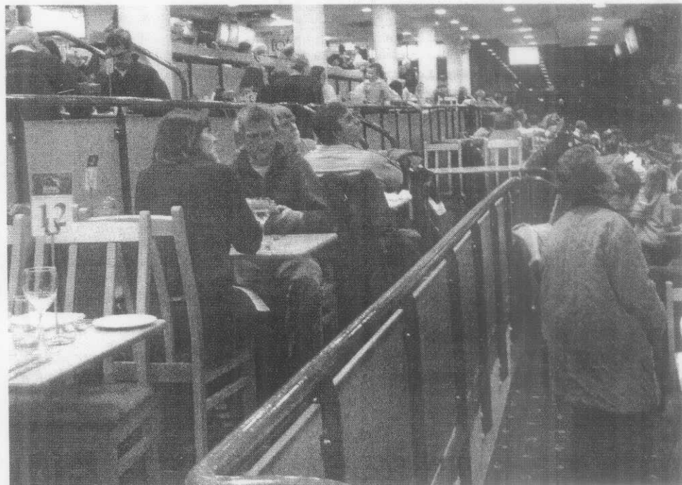
Diners pictured in the glass-fronted restaurant at the Tralee facility, the type which Limerick will have on its doorstep.