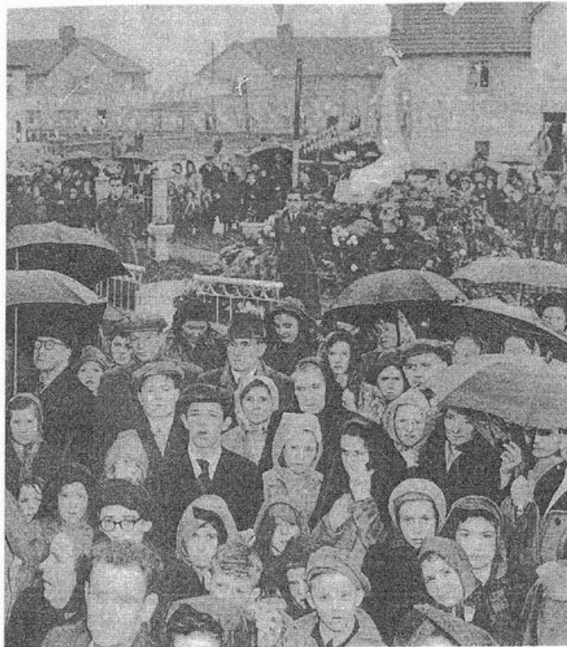
celebrations and prayer in Ballinacurra Weston in the 1950s. Locals fear the desecration of the statue.

as statue in Weston as 'a holy disgrace'