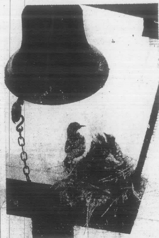
A mistle thrush and her four nestlings in the belfry of St. Mary's Convent School, Limerick. The mother bird laid and hatched her eggs in the nest 10 feet above the playground. The nest is no longer there—the birds have flown. See story on page 11.

"Professional social workers are employed and work in the different areas of the city, and