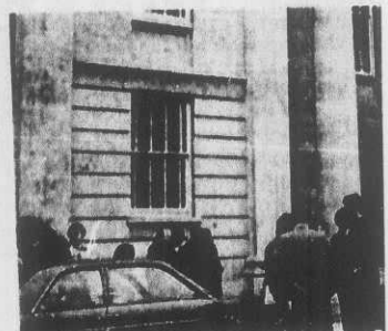
Health Board headquarters, week's sit-in.