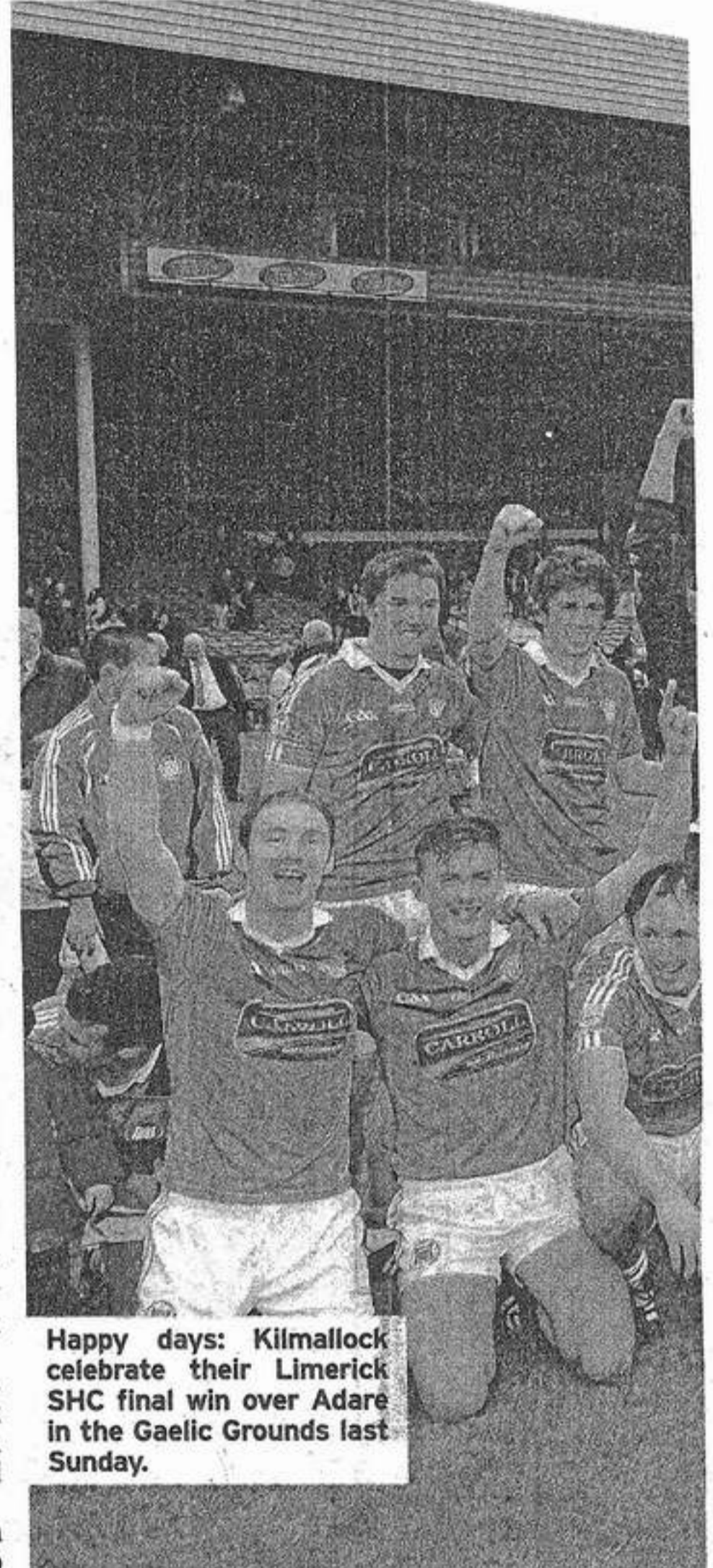
Happy days: Kilmallock celebrate their Limerick SHC final win over Adare in the Gaelic Grounds last Sunday.