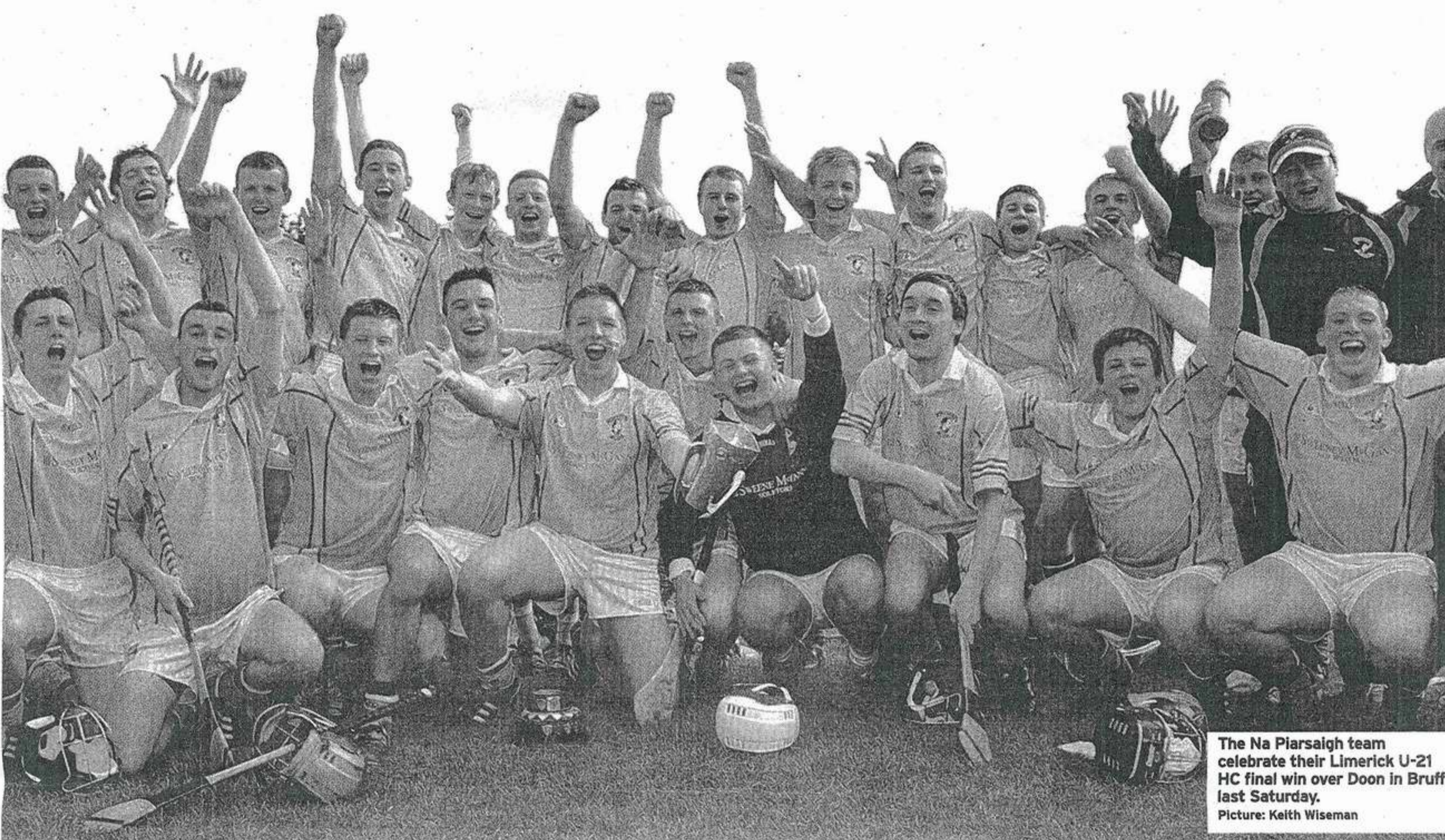
The Na Piarasigh team celebrate their Limerick U-21 HC final win over Doon in Bruff last Saturday.