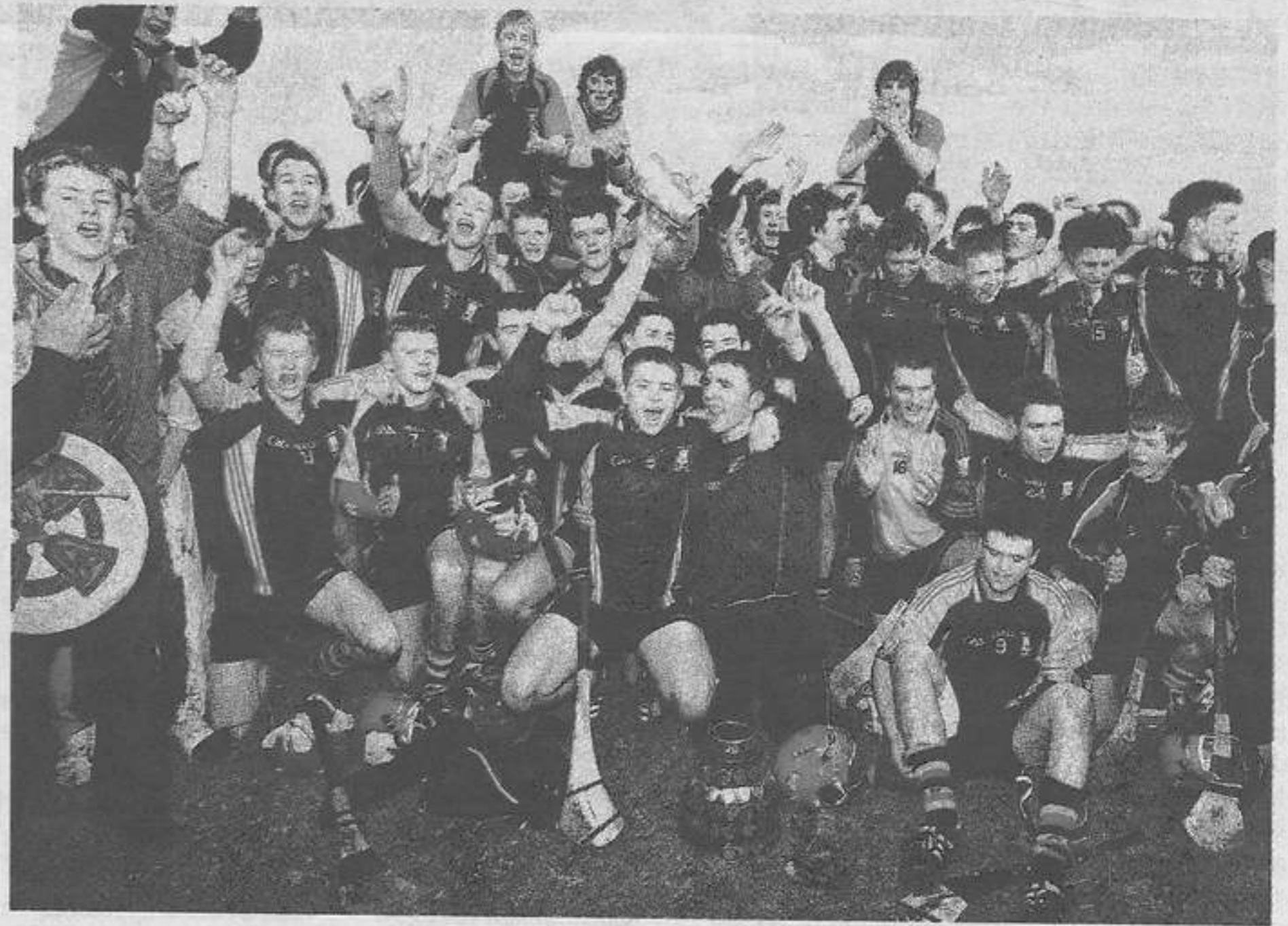
WORTH WAITING FOR: The victorious Ardscoil Rís team and their supporters celebrate their victory in the final of the Dr Harty Cup.