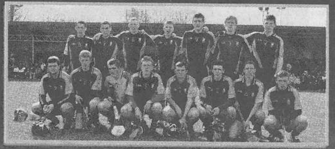
The Ardscoil Rís team that lined out for last Saturday's All Ireland Colleges A Semi-Final in Templemore against Kilkenny CBS in Templemore on Saturday March 20.