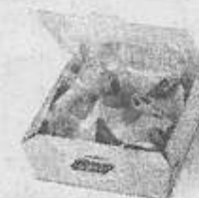
Melted Cheese Nachos