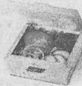
Garden Side Salad