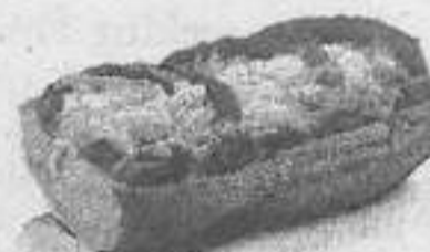
Pepperoni Pizza Toastie