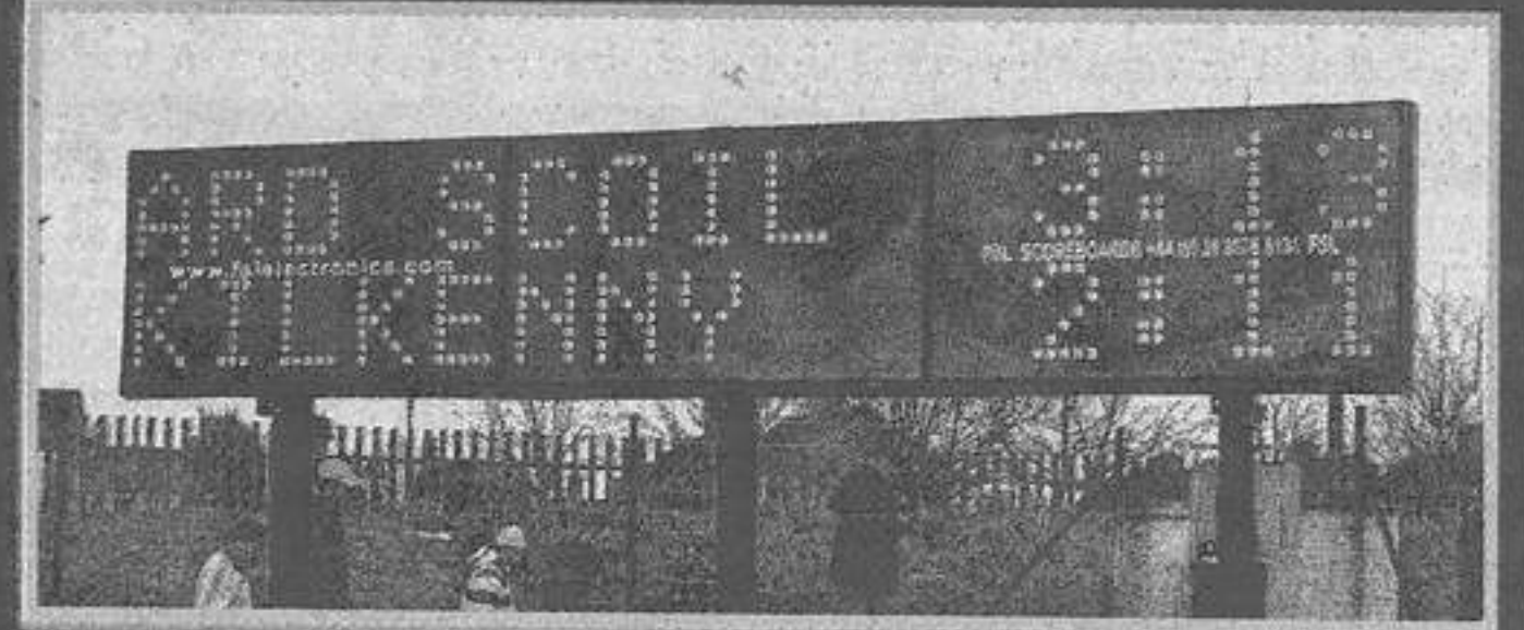
The final scoreline at Templemore on Saturday March 20 says it all — Ardscoil Rís, for the first time ever, are through to the All Ireland Colleges A Final!