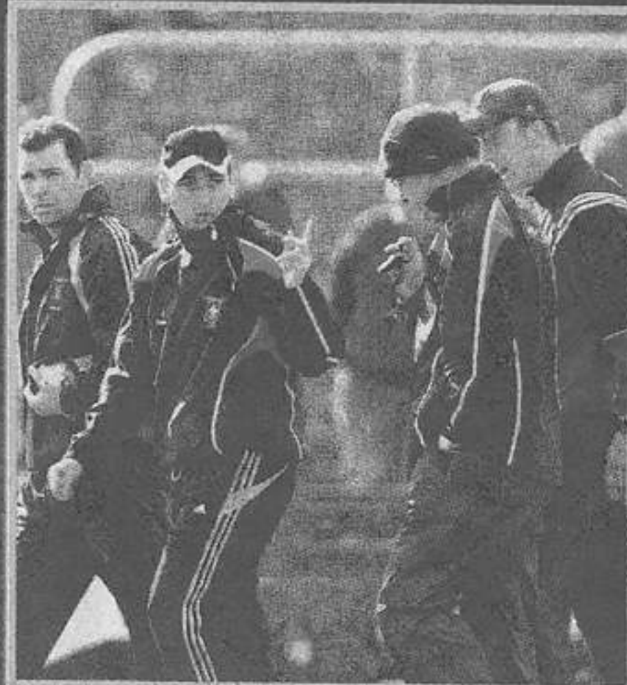
Ardscoil Rís coaches discussing tactics at half-time.