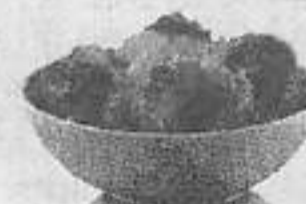
Bowl of Meatballs