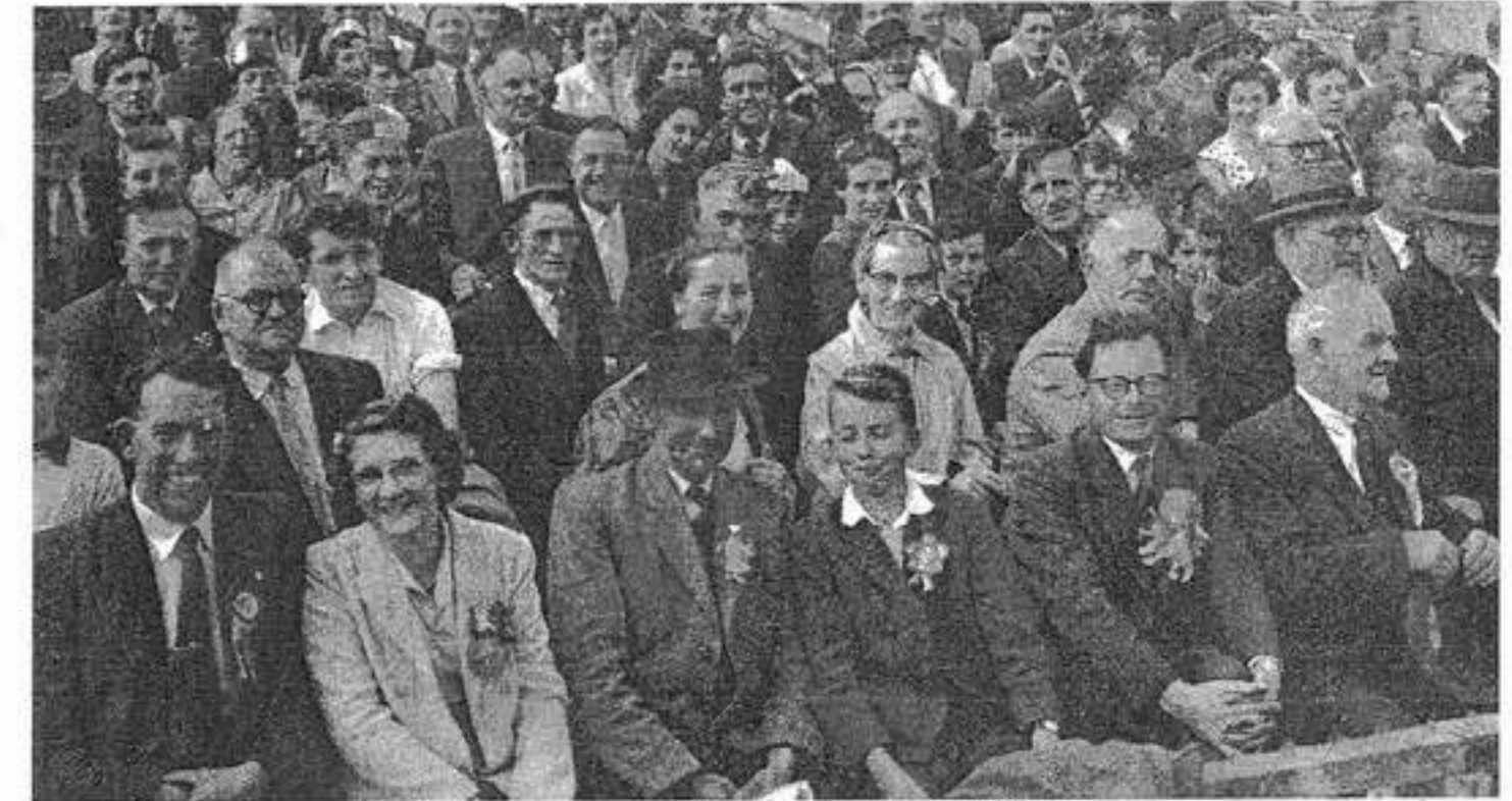
A section of the crowd supporting Limerick