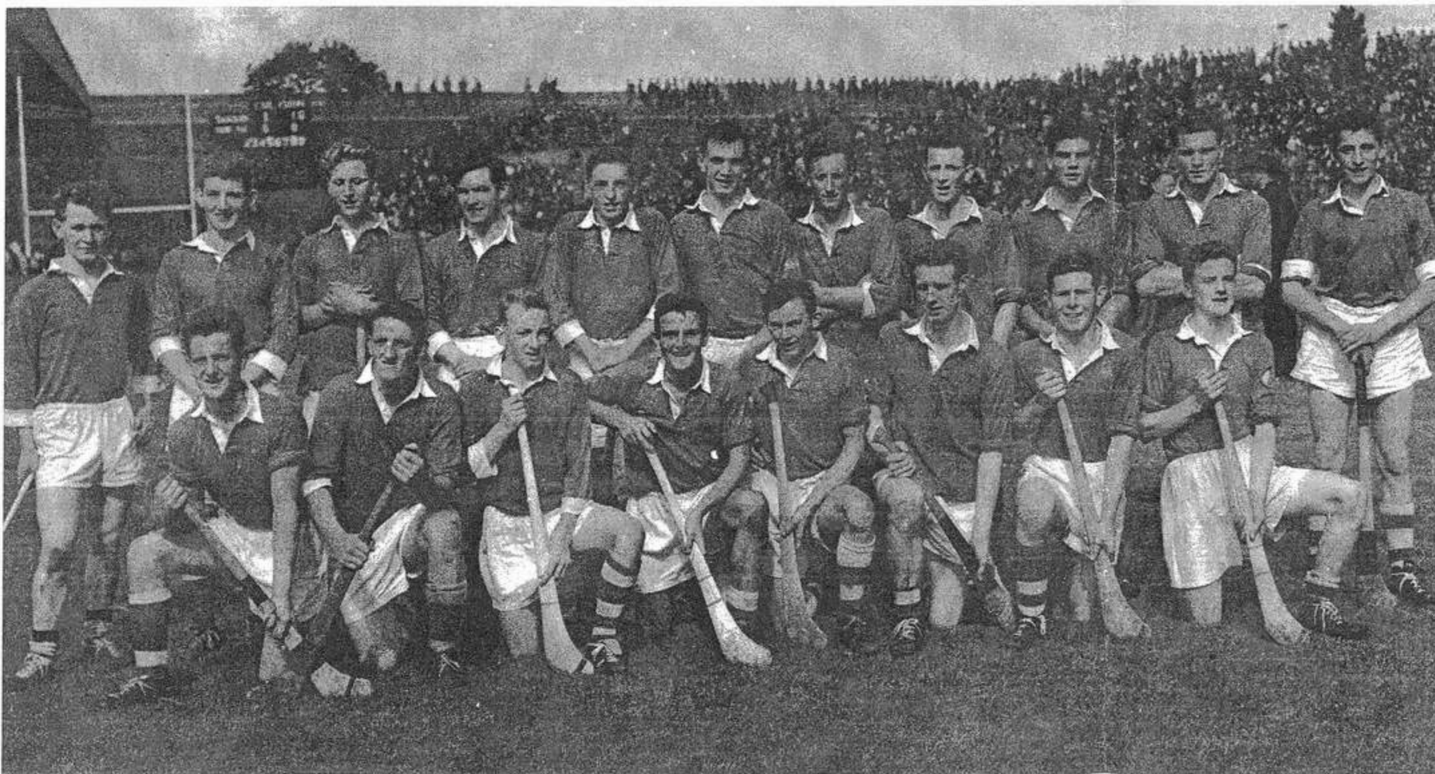
Our 1958 hurling heroes