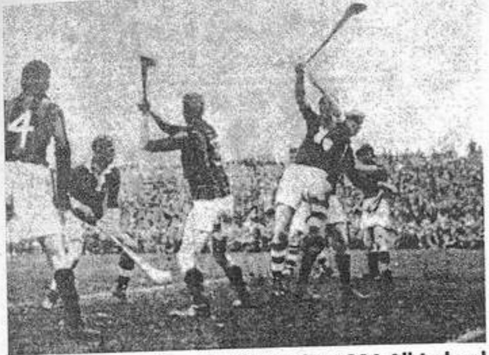
This is a rare action shot from the 1936 All-Ireland

Power. □ This page was inadvertently omitted last weekend -Jerome O'Connell