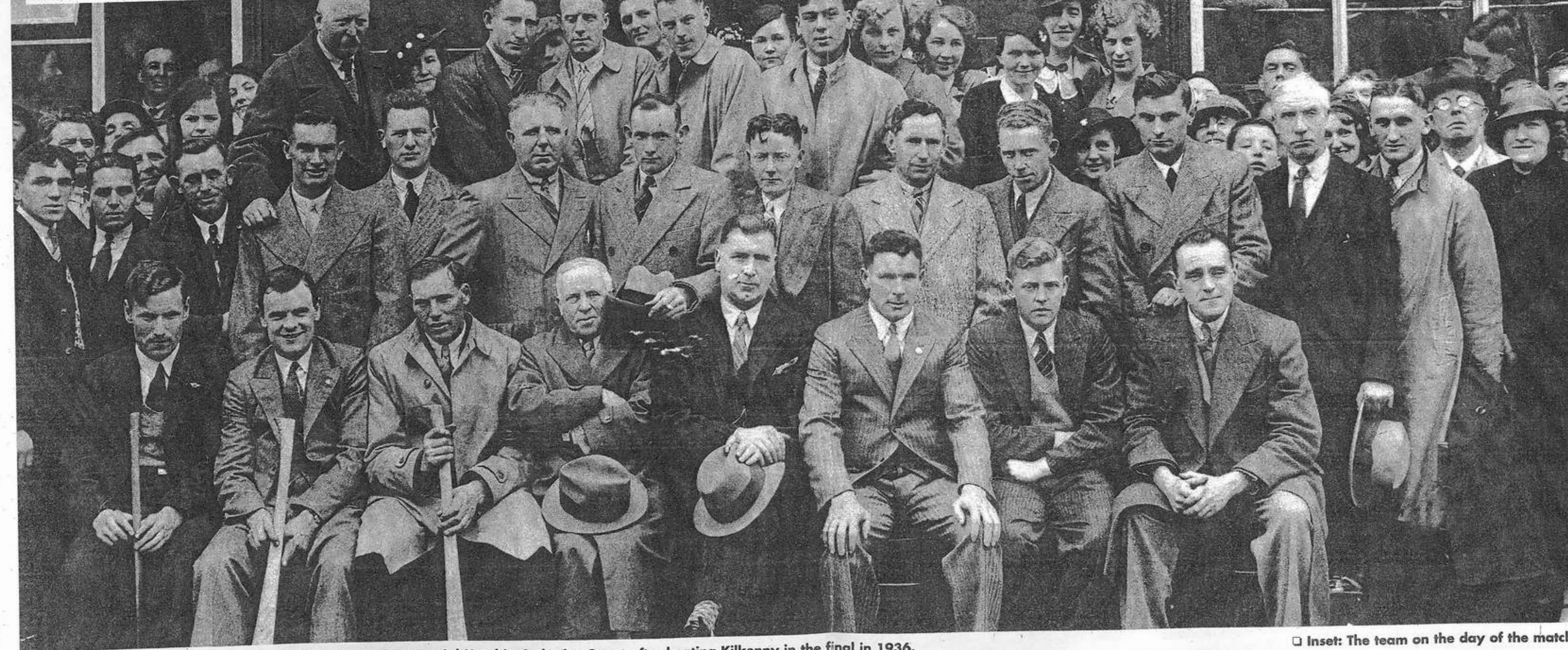
The Limerick team and county board officials outside the Imperial Hotel in Catherine Street after beating Kilkenny in the final in 1936.