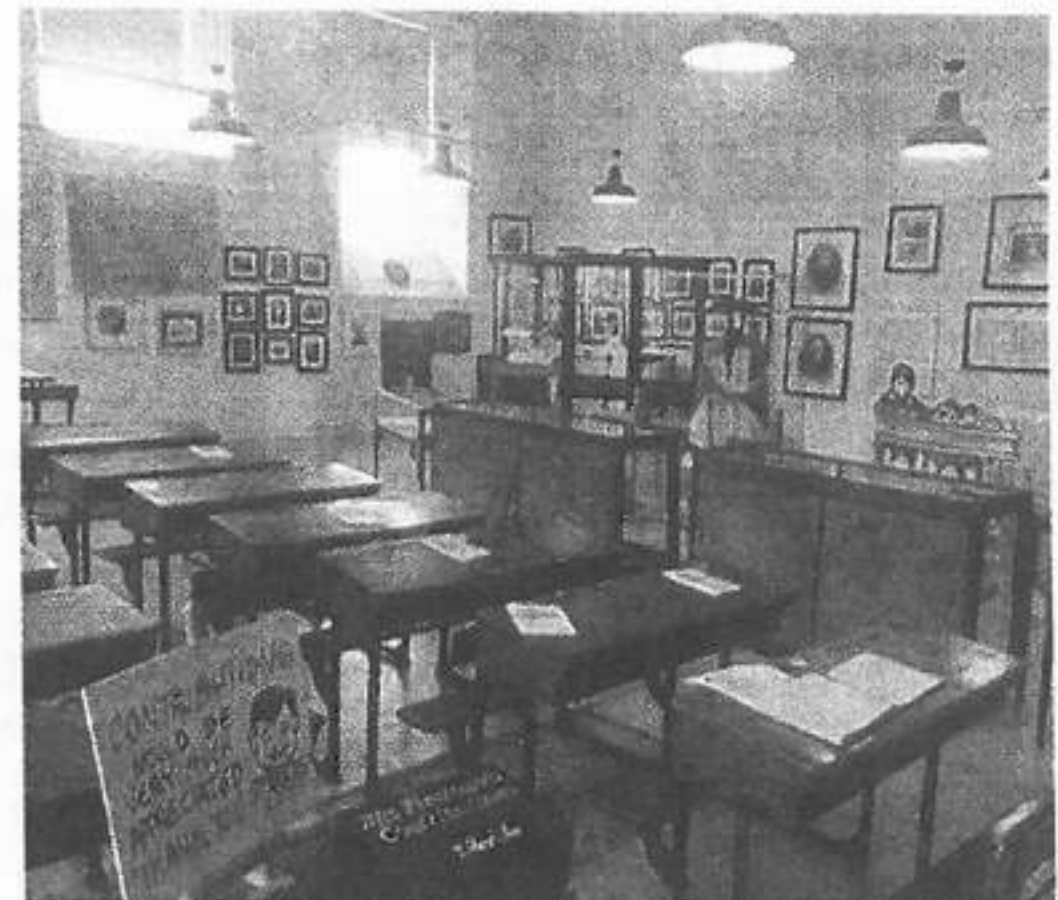
One of the rooms in Leamy House, currently laid out to replicate the young Frank McCourt's schoolroom