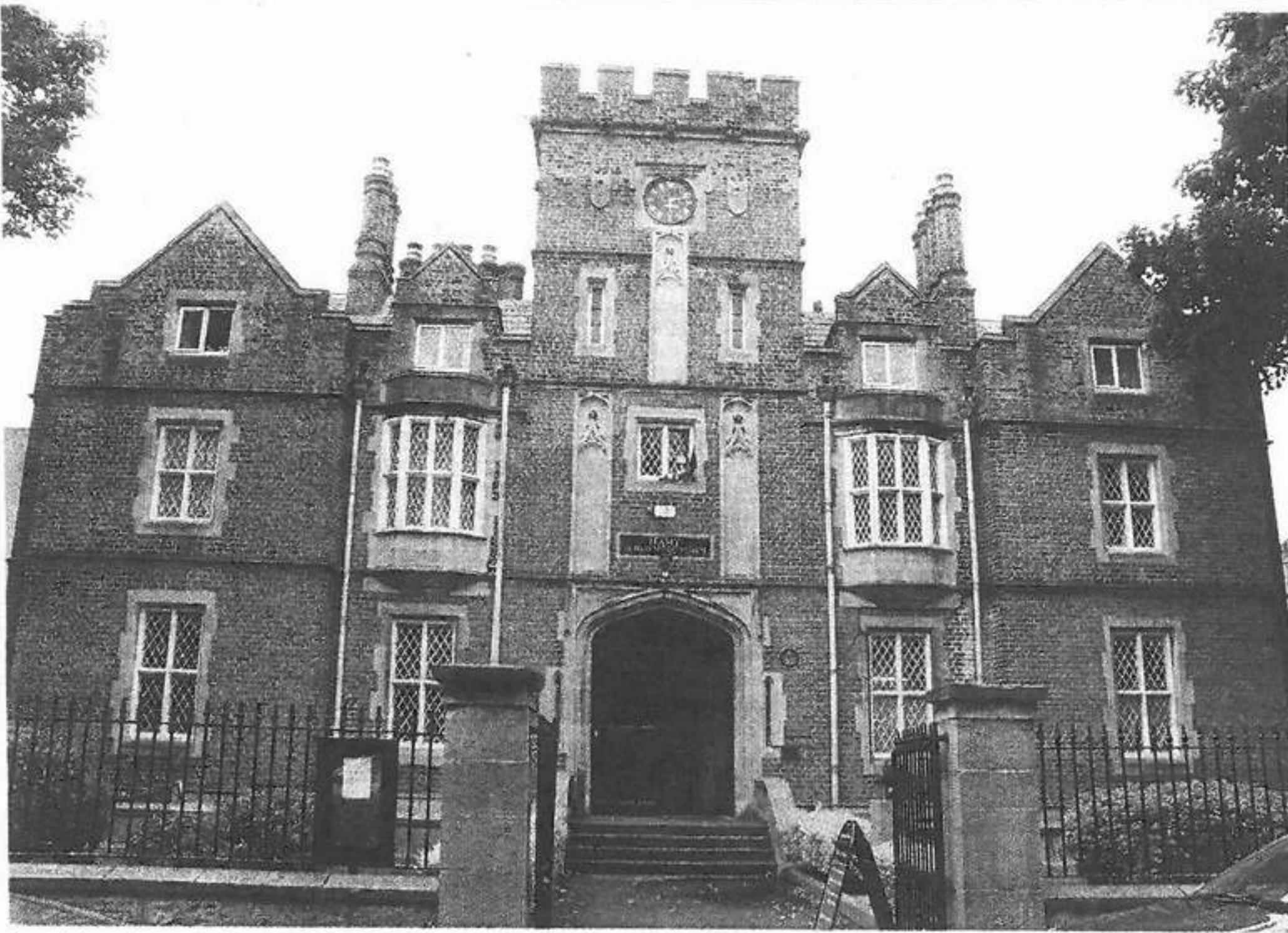
Leamy House: Currently home to the Frank McCourt museum, this property is of significant architectural and historic interest