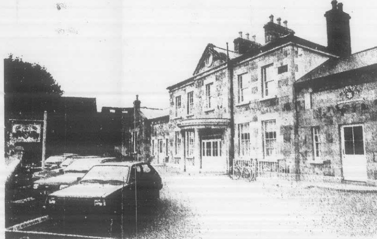
The Shannon Arms have parking facilities for all their customers.

While hot food is served all day there is a special lunch menu available from 12.30 to 2.30. The main course, which on the day we visited consisted of Boiled Limerick bacon, Southern Fried Chicken-Maryland, Oven Baked Trout and Grilled lamb cutlets, will set you back between £2.80 and £3.20. There was a choice of oxtail soup and chilled melon