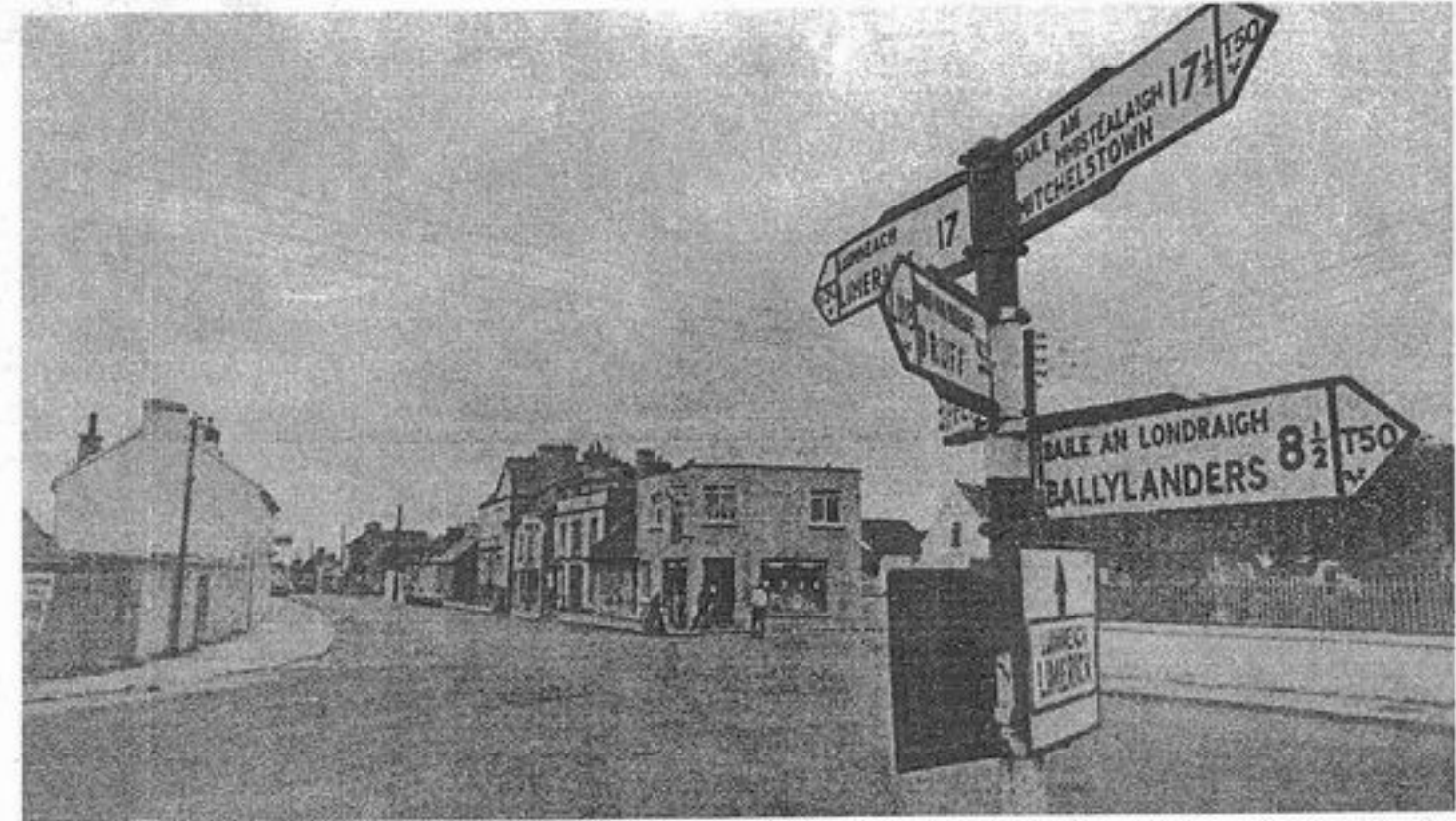
This is the village of Hospital in County Limerick. On the left as it is now and on the right, as it was in 1970. While the picture right was printed only recently it is interesting to note the changes that have taken place in a relatively short time