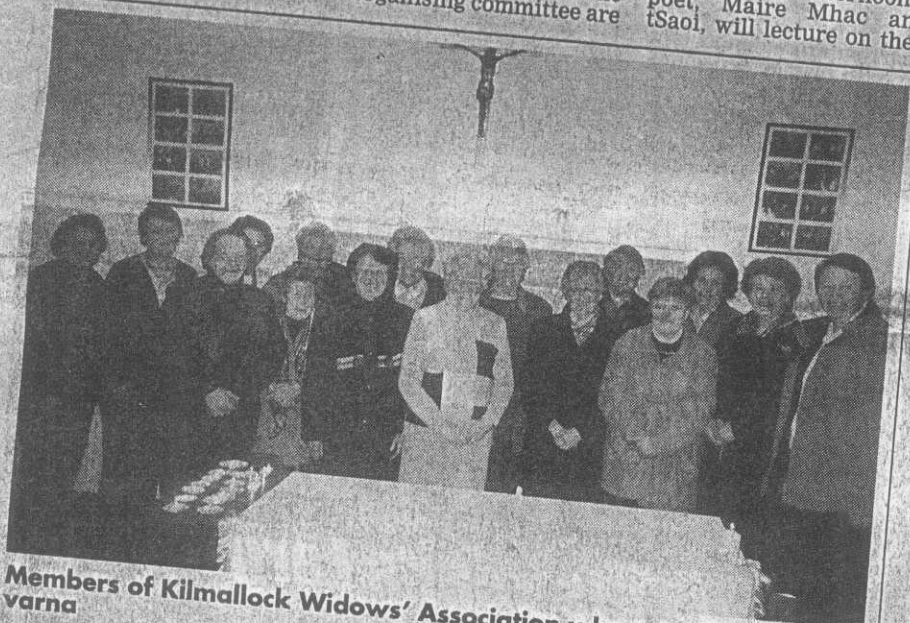
Members of Kilmallock Widows' Association who are off to Lisdoonvarna