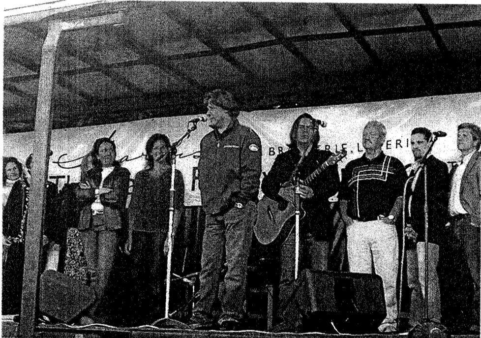
Russell Crowe addresses the gathered crowds at the unveiling of a memorial statue to Richard Harris.

“When I agreed, he replied, ‘Then you don't mind if I yell