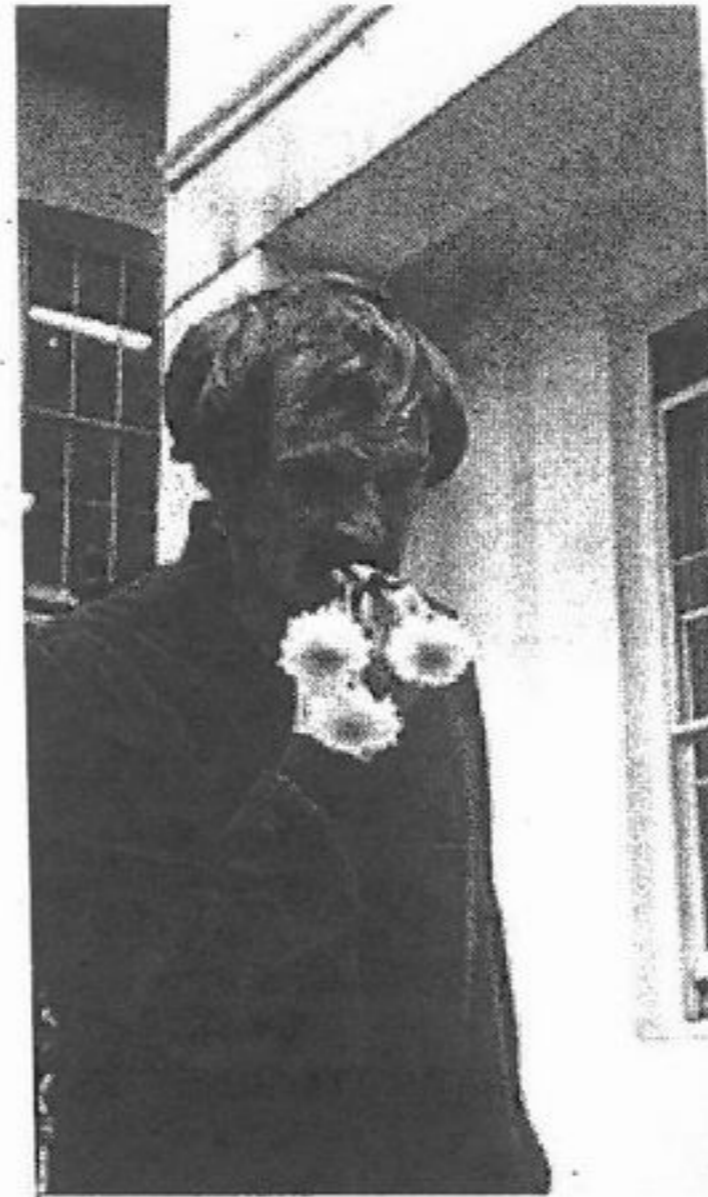
1967: Richard Harris and Jimmy Webb met and produced Richard's debut album 'A Tramp Shining'

Webb met actor Richard at a charity concert in LA and immediately hit it off. Harris taught him Irish songs. Webb promised to write music for the Limerick actor someday.