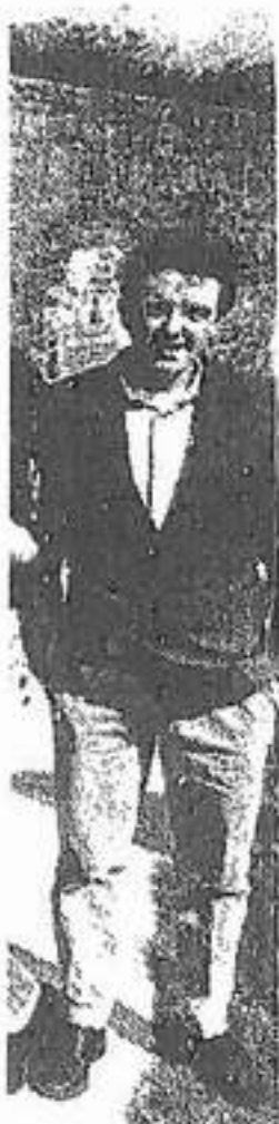
part in the ned by the , T.D.