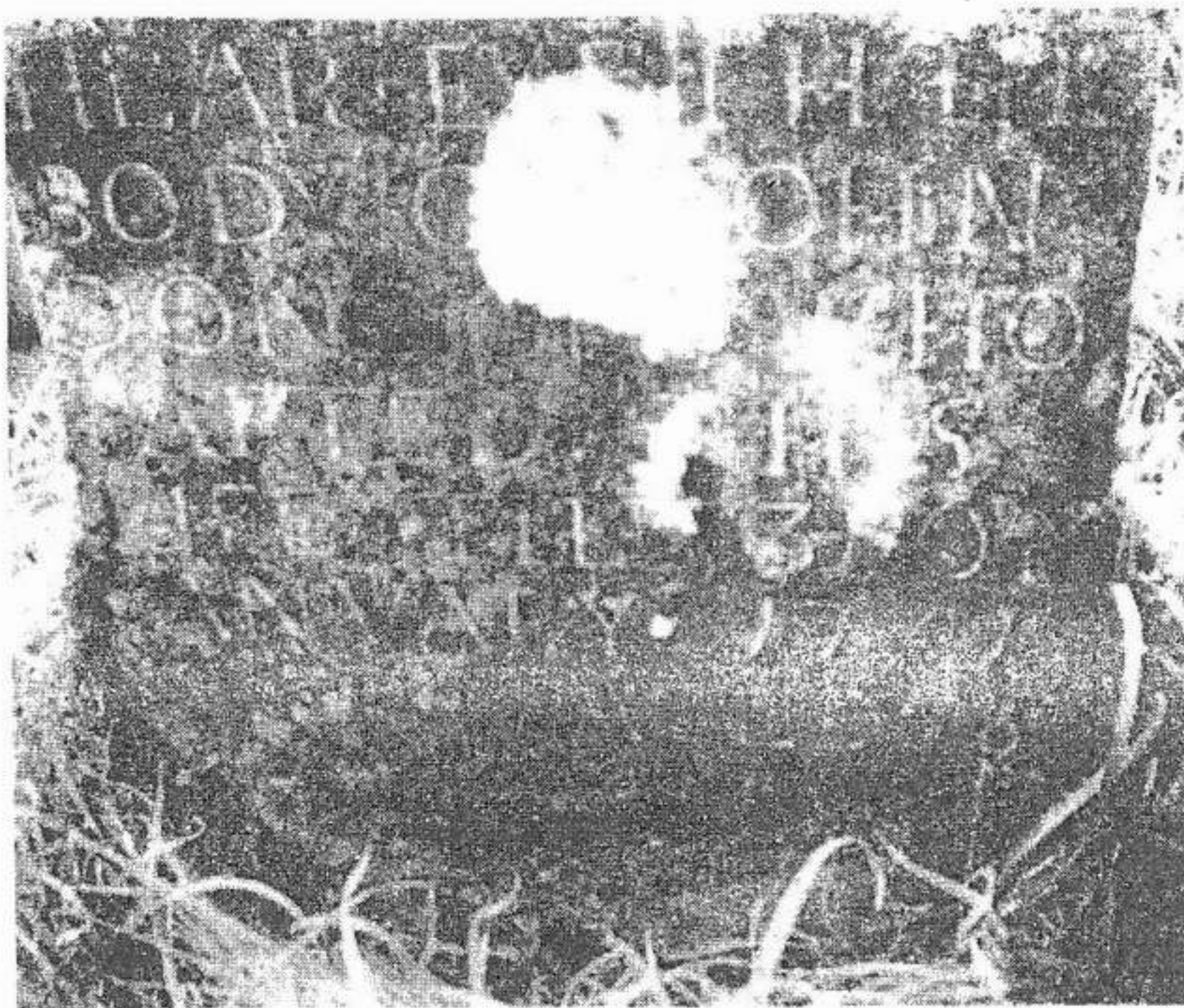
Oldest Headstone 1741