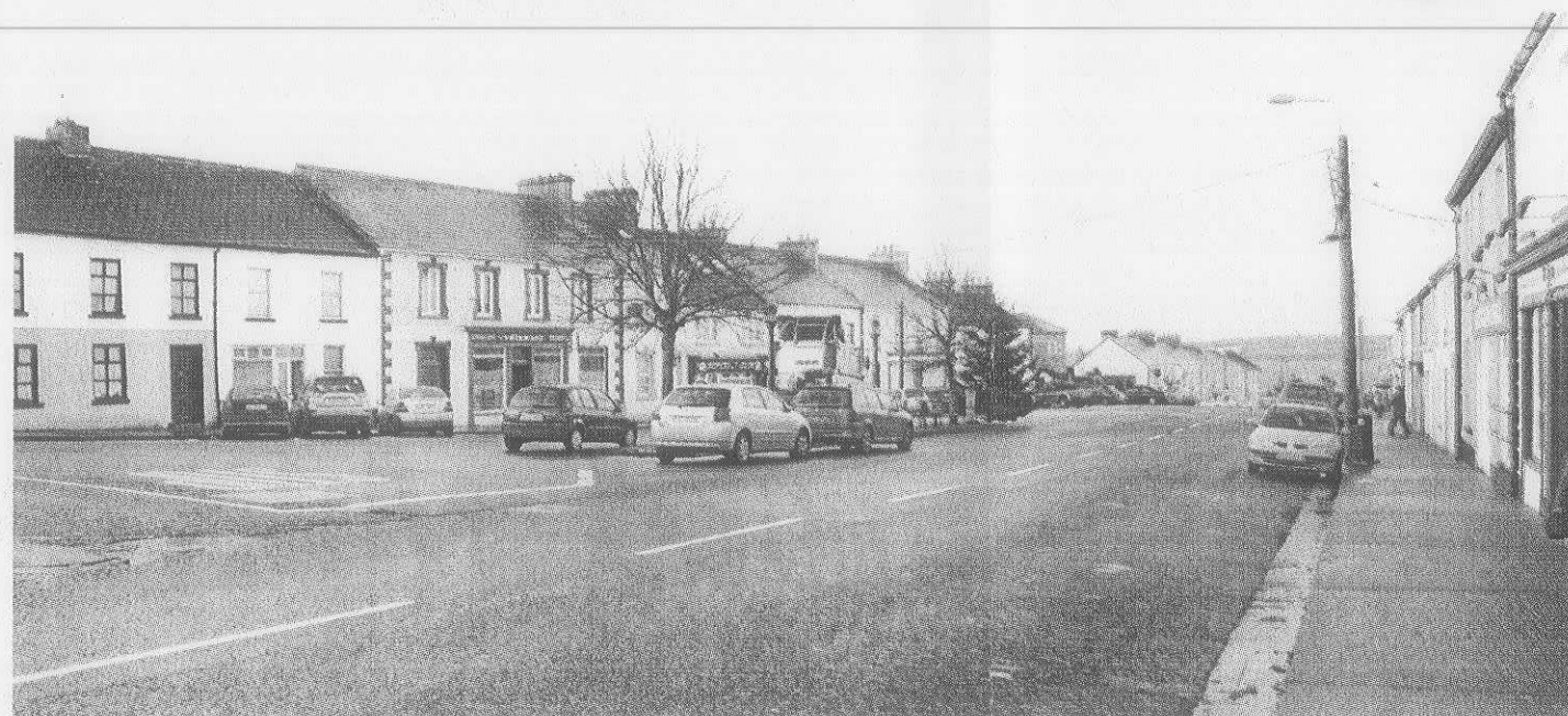
Main Street, Glin