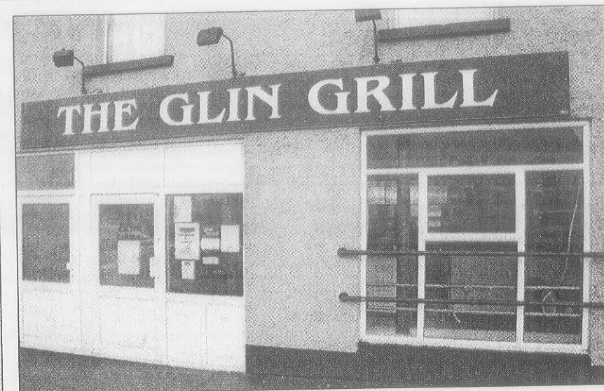
The Glin Grill

If you bring along your letters, Santa Claus will take them back to the North Pole so that the elves can start packing your presents.