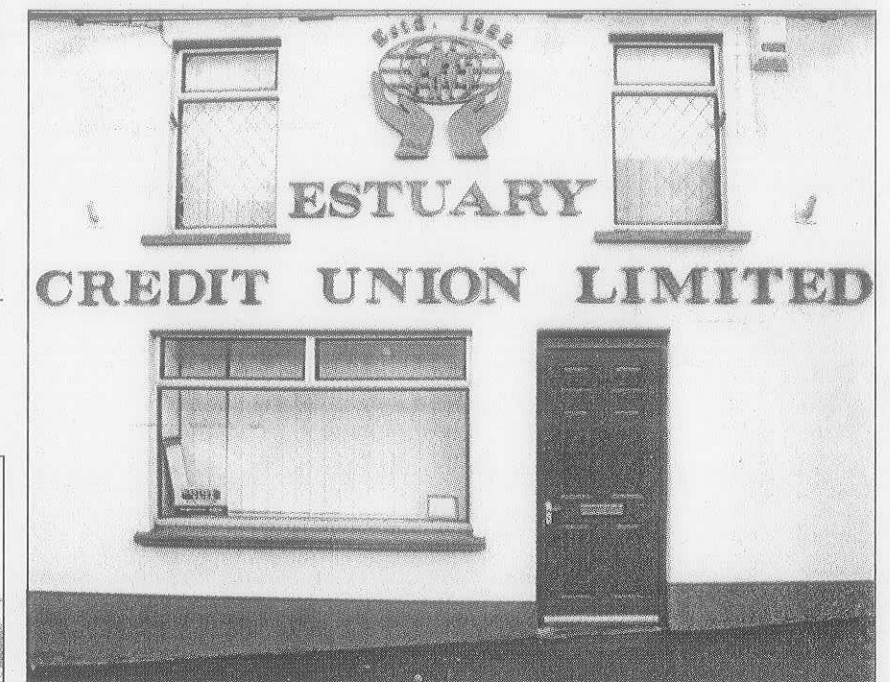
Estuary Credit Union