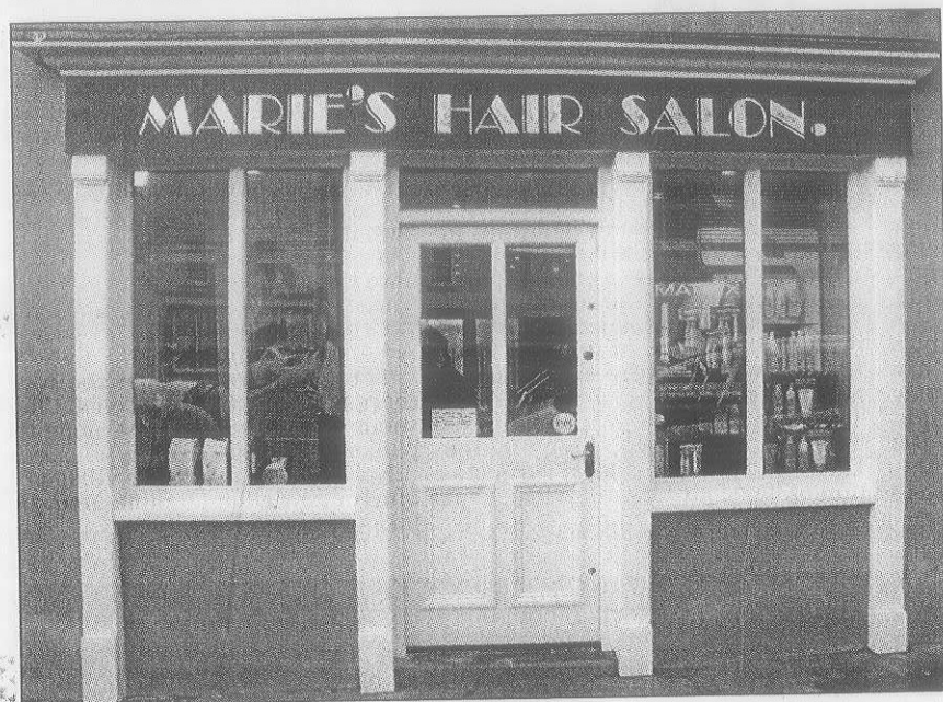
Marie's Hair Salon