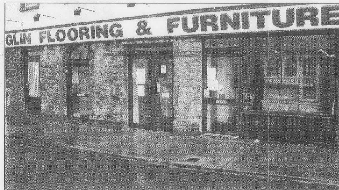
Glin Flooring & Furniture