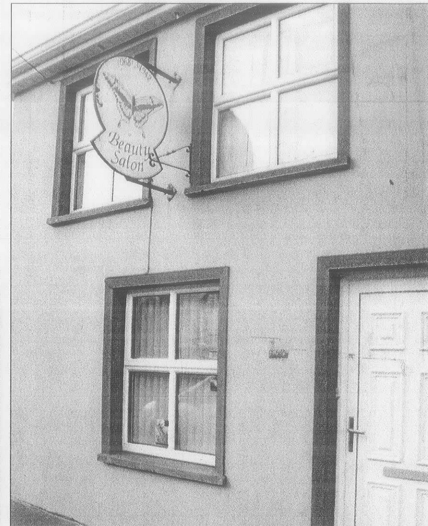
Brid's Beauty Salon