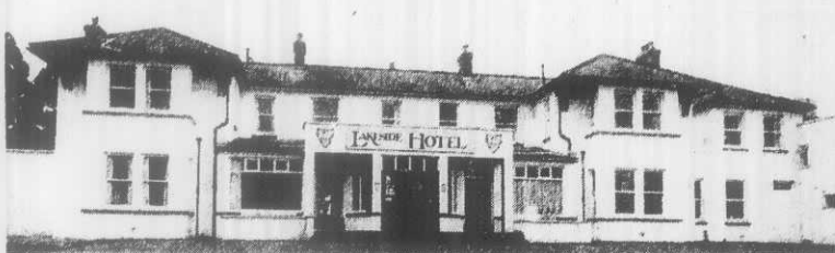
The Lakeside Hotel.