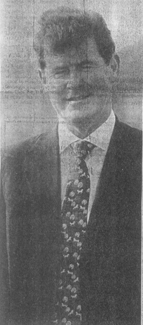
Racehorse owner and business tycoon JP McManus: though he jets around the world and mixes with some of the best-known and richest people, he has never forgotten his roots

Exploration and Department of the Environment, Dublin 4 Ph: 01 619 95 69 Ref: MA 222/21 2001