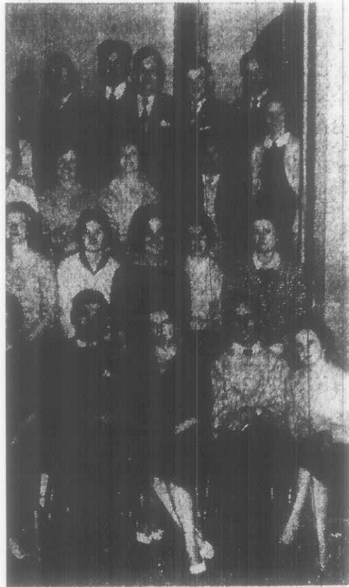
...oral Society in the City Theatre each night next

The question of extending Fernbank Salesian Convent School to accommodate 400 pupils, is under consideration.