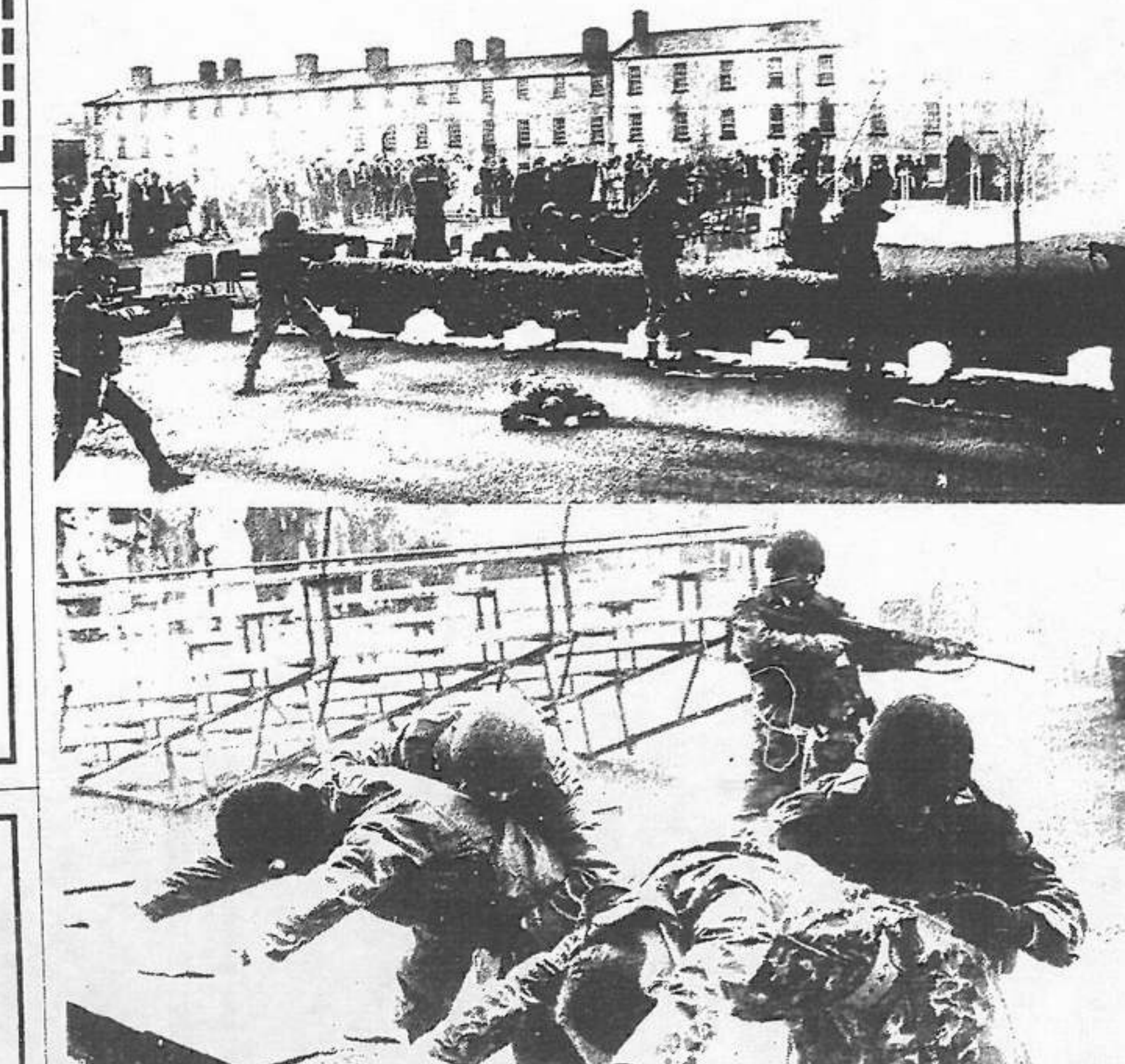
Members of the 72nd Recruit Platoon taking part in a simulated assault on terrorists, their four-month training course.