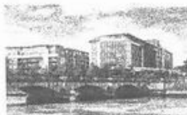
Fall: the Limerick Strand Hotel