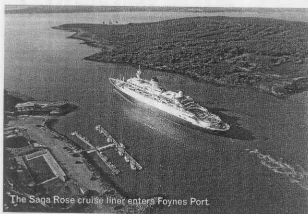
The Saga Rose cruise liner enters Foynes Port.