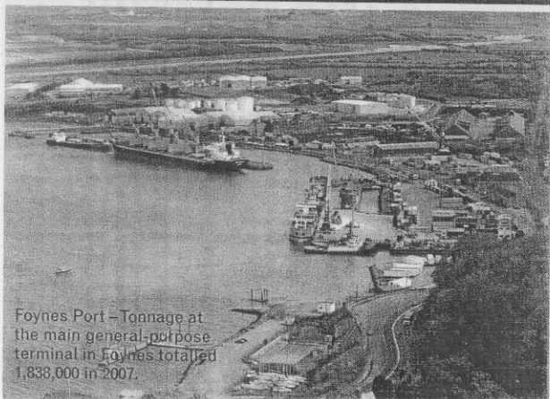
Foynes Port – Tonnage at the main general-purpose terminal in Foynes totalled 1,838,000 in 2007.