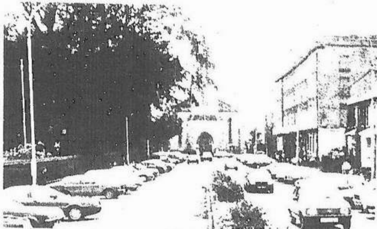
Preserving the aura of Edmond Sexton Pery: Pery Square.