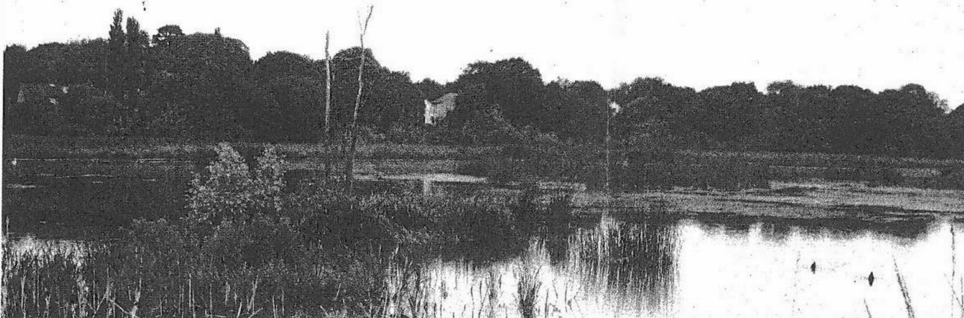
Westfields: public asked to watch out for weeds