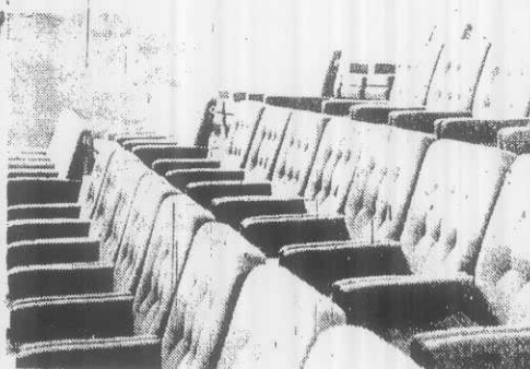
● The Jumbo Seats in the Balcony

• The ONLY Cinema in Ireland with JUMBO ARMCHAIR SEATING!