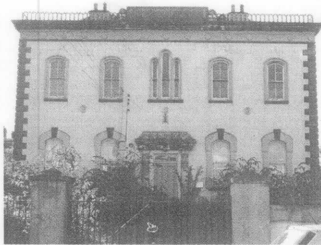
The former Garda Station on O'Curry Street which has been allowed to deteriorate

"I've written to the Port Company advising them that there is no point in the building being deemed a protective structure if no remedial/conservation works are being carried out to it, and I've also been in contact with a planning official in City Hall, who assured me she will raise the issue with her senior