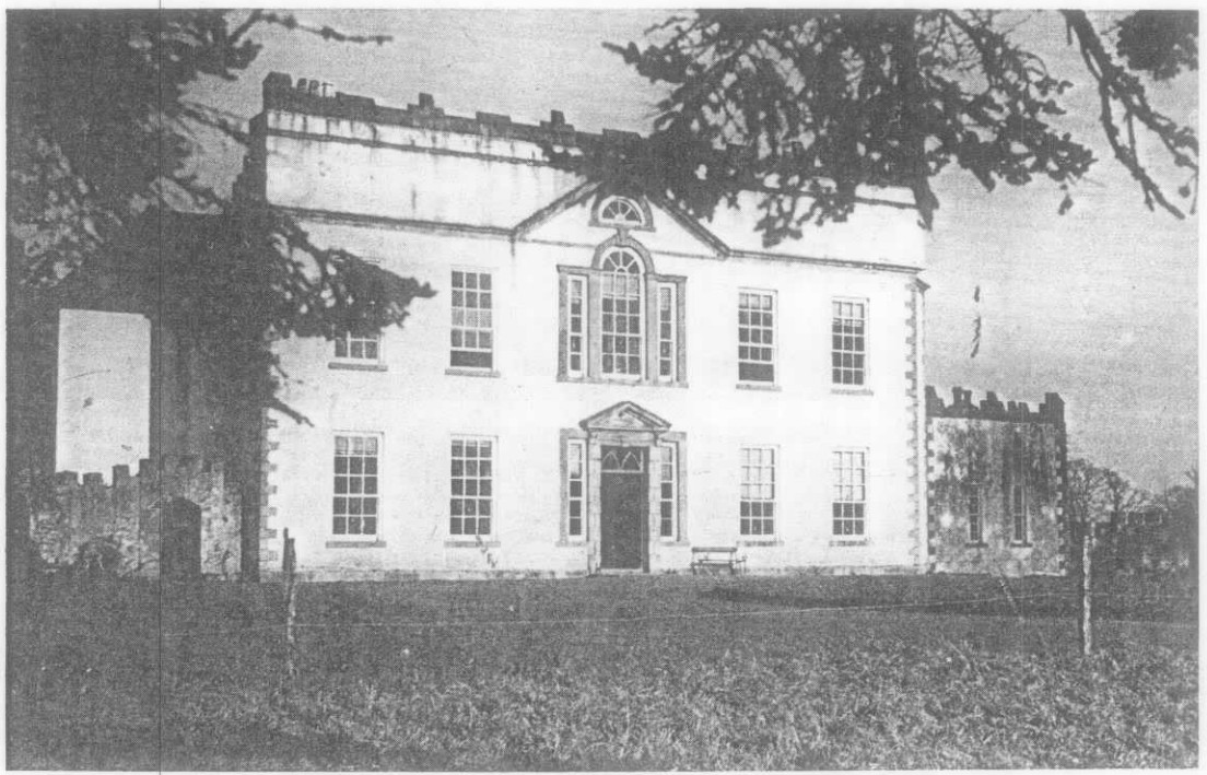
Castlepark, Limerick. A photograph taken by Stan Stewart in the early twentieth century showing the fine eighteenth century front with its unusual central portion containing the cut stone pedimented doorcase at its ground floor level.