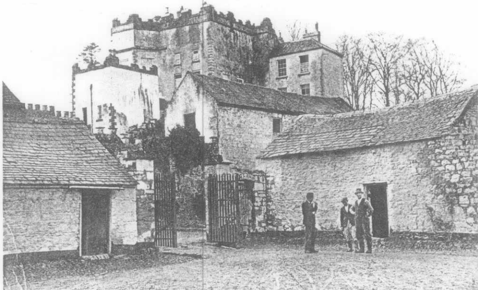
The stepped rear of Castlepark, Limerick, with its fascinating conglomeration of buildings including the small two-bay return (centre right) and various utility constructions.