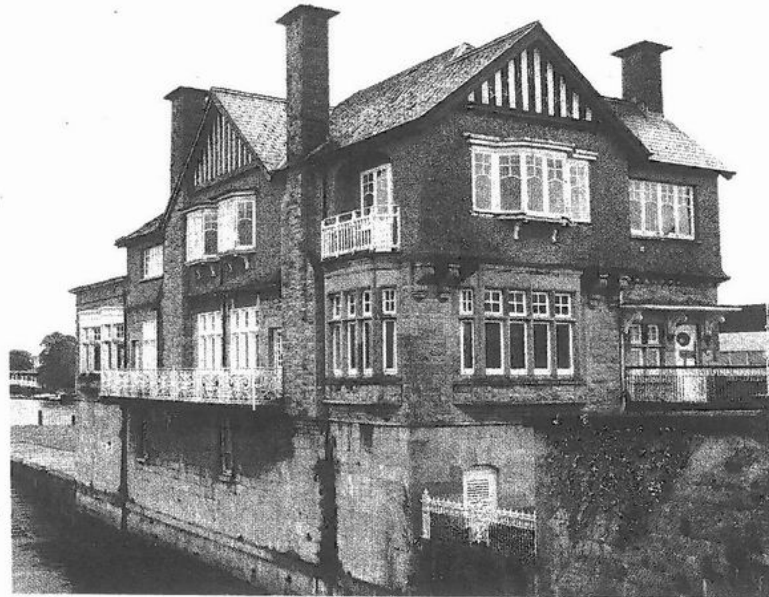
Shannon Rowing Club archives preserved for future generations

"The donation means the collection can be cared for correctly and preserved for future generations by Limerick Archives. Once catalogued, the collection can be viewed by members of the public by appointment," he added.