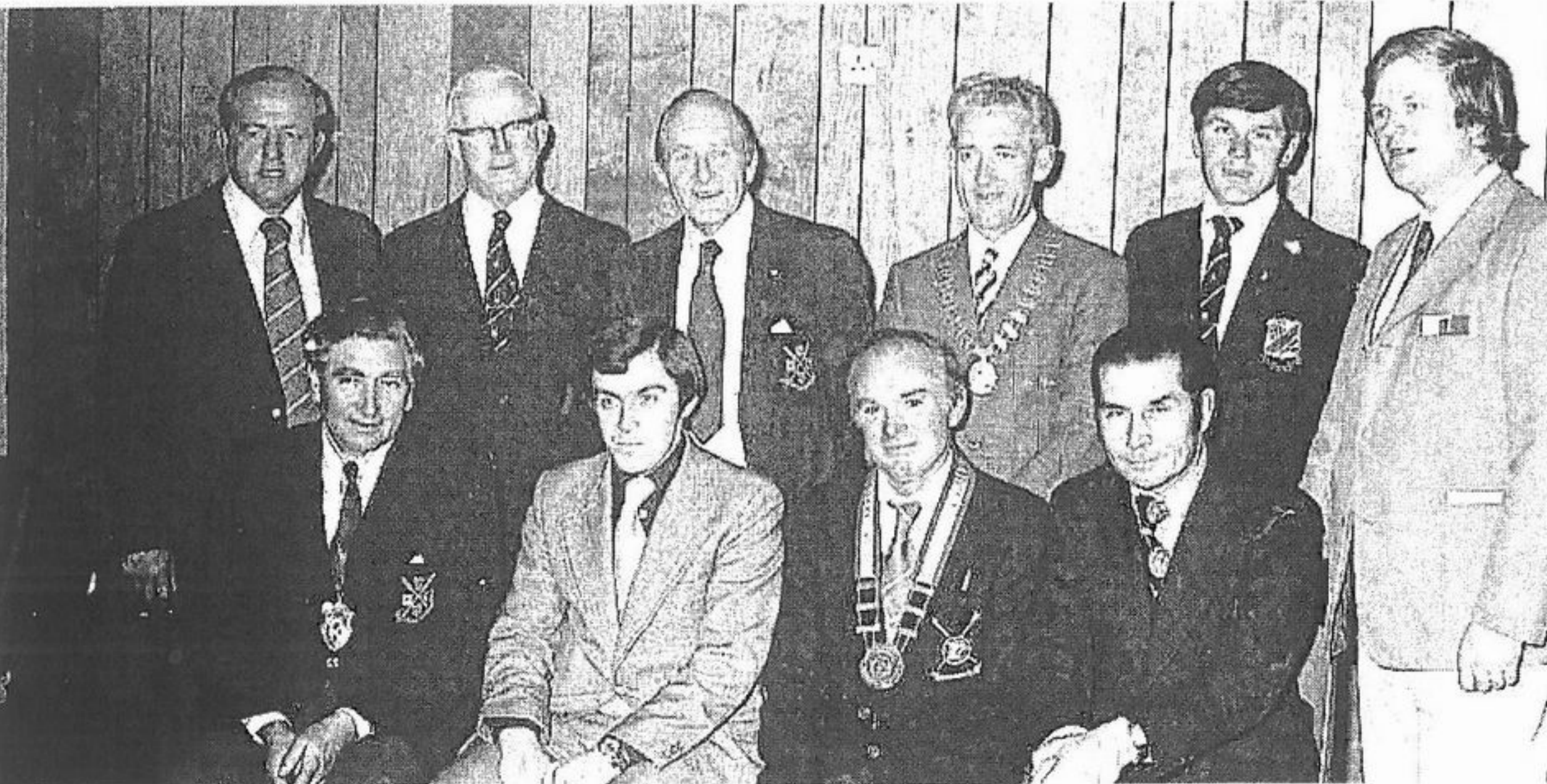
Above: St Michael's Rowing Club members at the launch of the club's new boat, "The Ned", in 1958