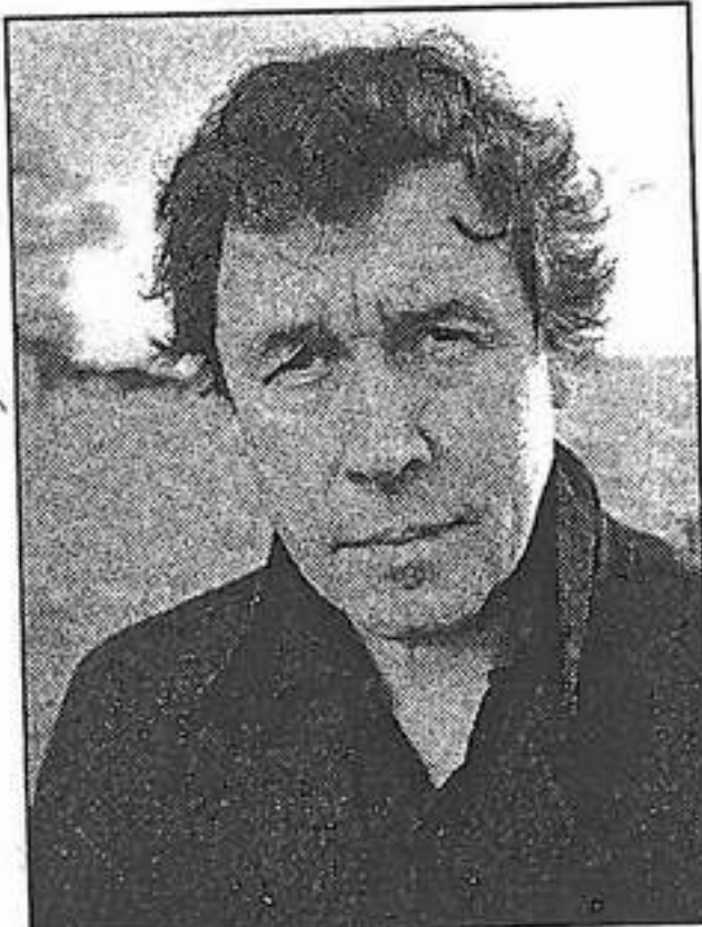
Reading: movie star Stephen Rea is in the Lime Tree