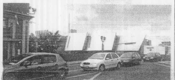
The proposed €20million development as it will appear from Shannon Rowing Club, left, and from Sarsfield Street