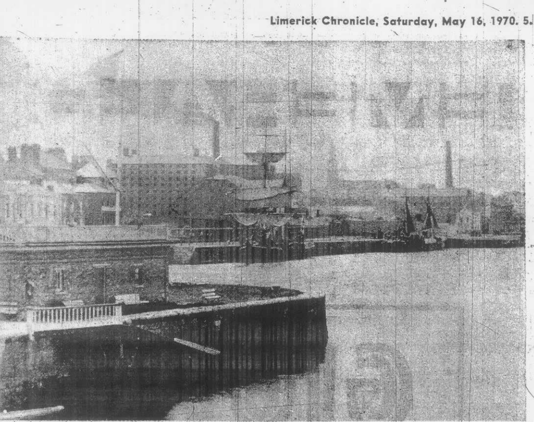
An interesting picture, taken about 1871 and now published for the first time, of the original L.B.C. boathouse on Wellesley Pier. Old masted schooners may be seen at the quayside in the background.