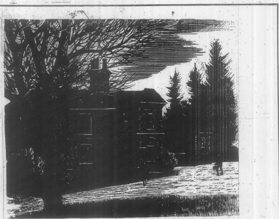
MONKSTOWN HOSPITAL. Originally the Rathdown Infirmary, Monkstown Hospital came to its present site in 1835. A small hospital with 26 beds it treats over 2,000 out-patients a year and is an important asset to its community.