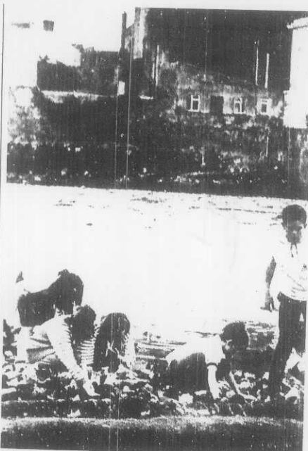
Children collecting eel fry on the banks of the Cathedral in the background.