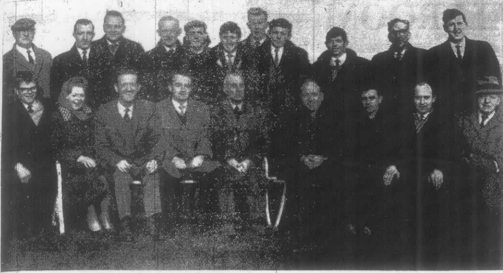
A group of Athlunkard supporters pictured in happy mood on the club premises.